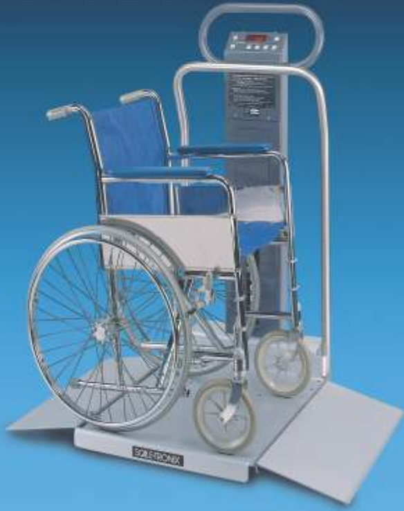
Scale-Tronix 6002 3 in 1 WheelChair, Stand On & Chair Scale

There are more than 2000 Scale-Tronix scales in use in 400 plus healthcare facilities in Canada. 3 of every 4 customers have purchased multiple scales and more than 90% use more than one model of Scale-Tronix scale.